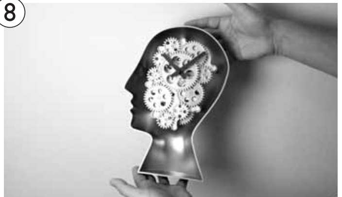
PUT THE CLOCK CAREFULLY IN PLACE AFTER SETTING THE TIME