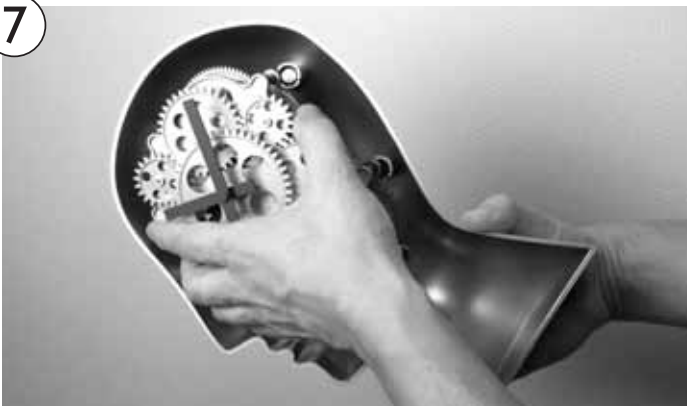
CAREFULLY TURN AROUND THE CLOCKWORK AND REPLACE IT ON THE MAGNETS