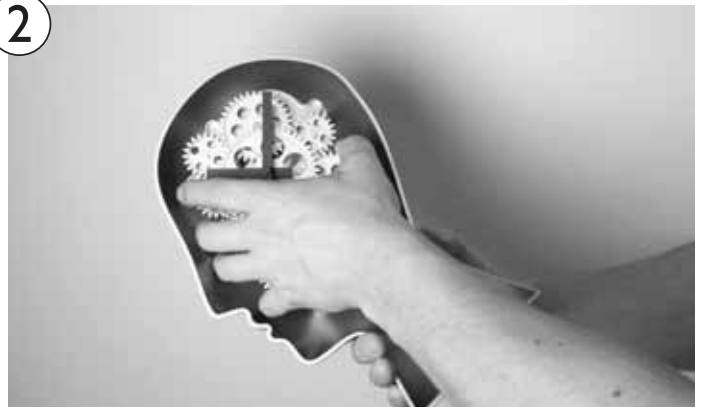
HOLD THE CLOCKWORK GENTLE IN YOUR HAND