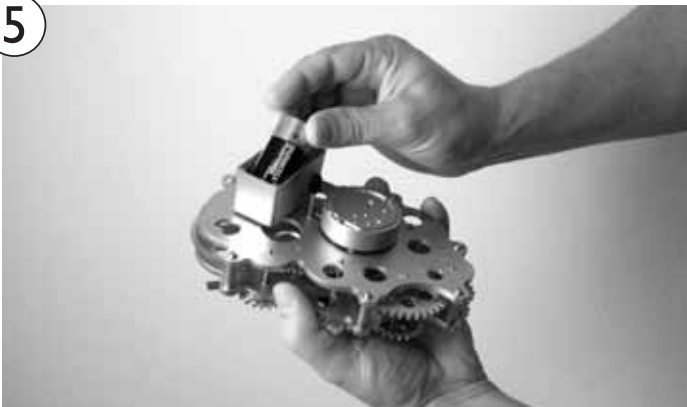
PLACE BATTERY IN THE CORRECT WAY ( + / - )