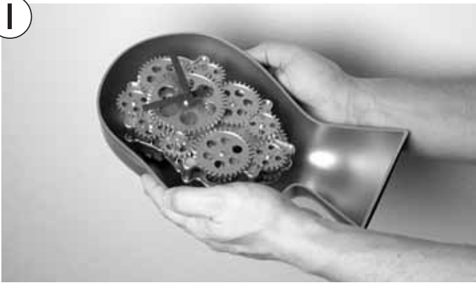
TAKE OUT ITEM FROM BOX CAREFULLY, POINTERS UP