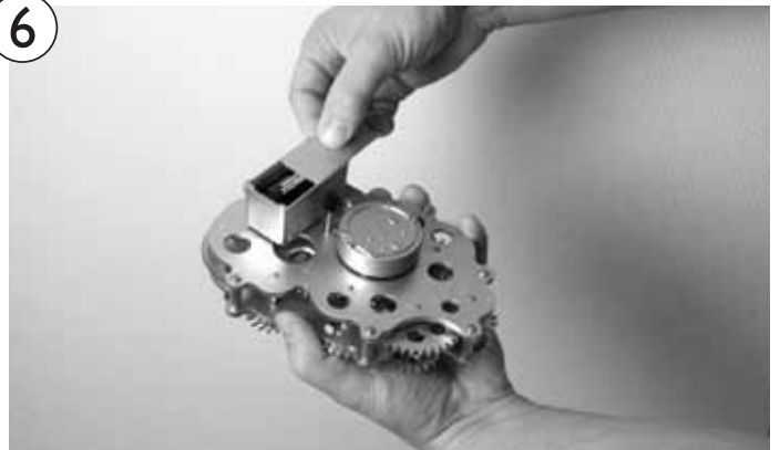
CLOSE THE BATTERY-HOLDER, SLIDE BACK THE LID